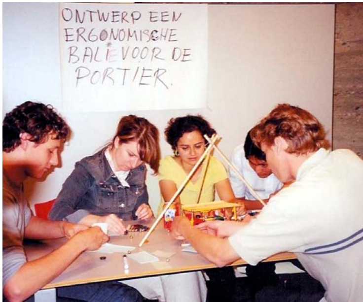
Figure 3: Constructing a metaphoric object together.