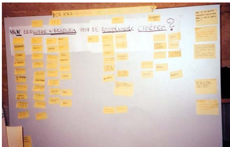
Figure 2: Formulation of the design task.

In this session, we chose the 'Key Words Technique' for defining and refining the problem in question. In this technique, the basic structure of the question is: 'in what way might somebody do something with/to/for/about something ?' (Daupert 2004). In a writing brainstorming session, alternative words were generated for somebody, something and something. This led to a number of possible questions (see Figure 2).