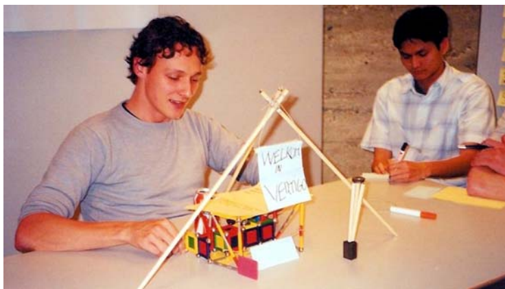
Figure 4: Presentation of the constructed object and noting the ideas.