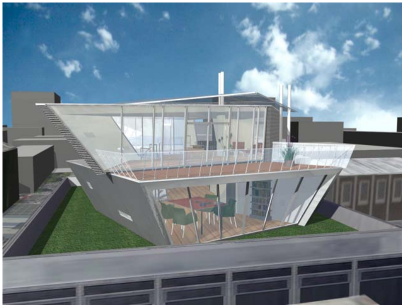
Figure 2: A penthouse design.

For Archipel Ontwerpers (The Hague) we wrote an algorithm generating random buildings within certain stylistic constraints. The algorithm was geared towards generating penthouses to be realized by means of a steel construction method which allows considerable freedom in the angles of walls and roofs. Archipel Ontwerpers used our algorithm interactively and chose one of its designs for further elaboration. The resulting design is expected to be realized next year as a penthouse on top of an existing building in the Witte de Withstraat in Rotterdam (Cf. Melet and Vreedenburgh 2005).